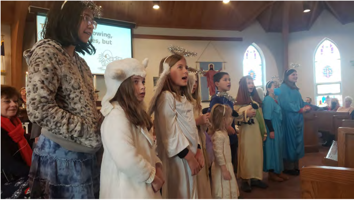
Children’s Sunday School Sings “Emmanuel, God is With Us”