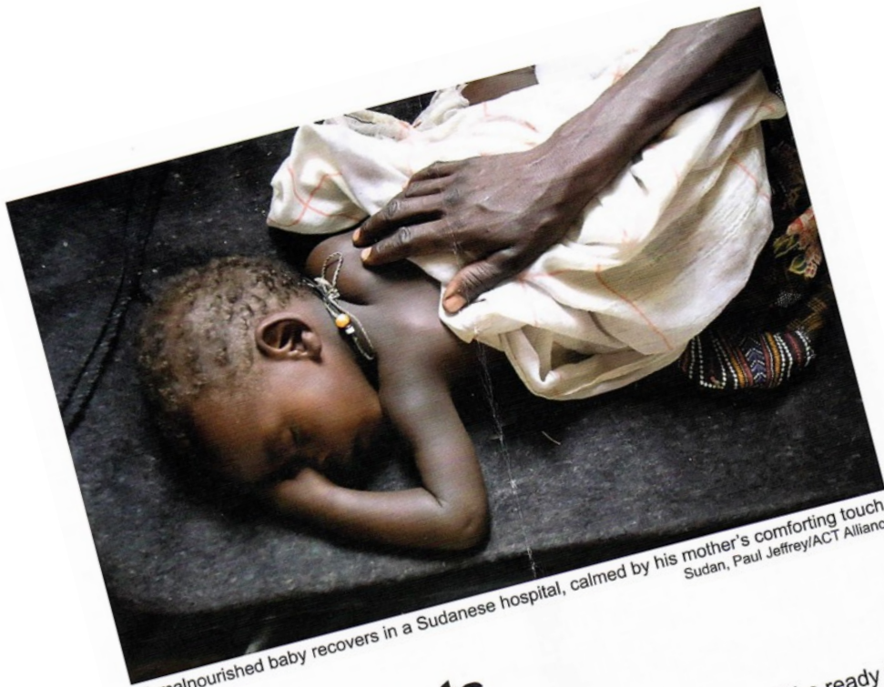
A malnourished baby recovers in a Sudanese hospital, calmed by his mother's comforting touch. Sudan