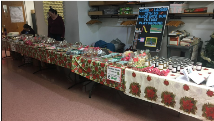
Bazaar Bake Table DPUMC Bazaar Saturday, Dec 7, 2019