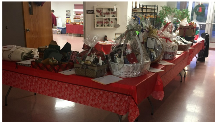
Silent Auction Table DPUMC Bazaar Saturday, Dec.7, 2019