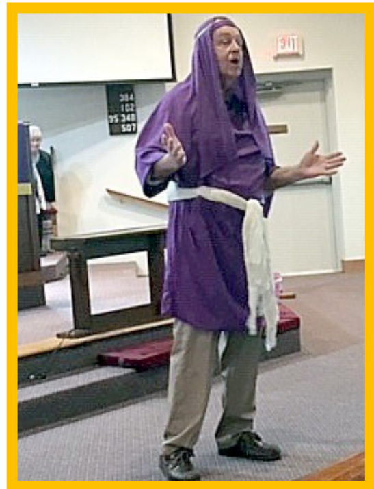
Nicodemus, the Pharisee