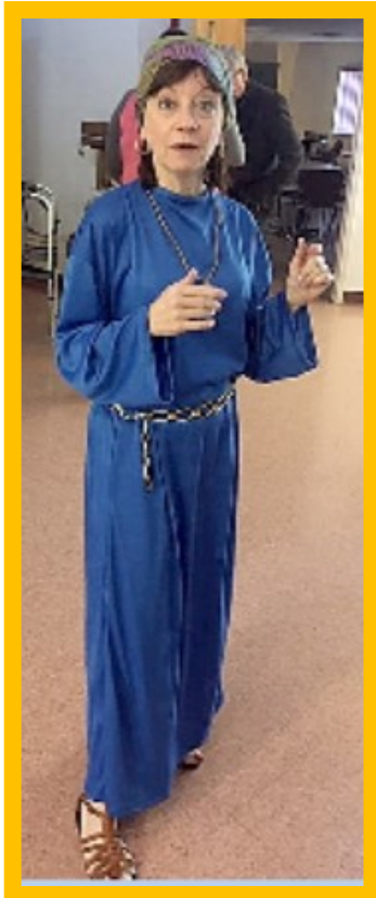
Marah, who washed Jesus' feet