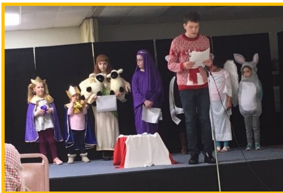
Part of the cast, Sunday, December 16, 2018 as the Children's Ministry presented "The Christmas Story"